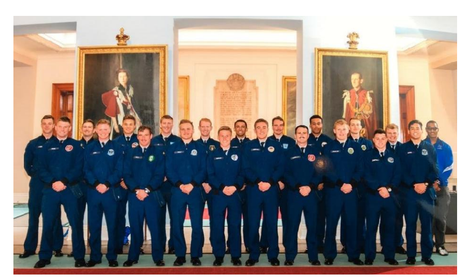
Tour of the College Hall Officers Mess on the eve of the 100<sup>th</sup> Anniversary of the RAF