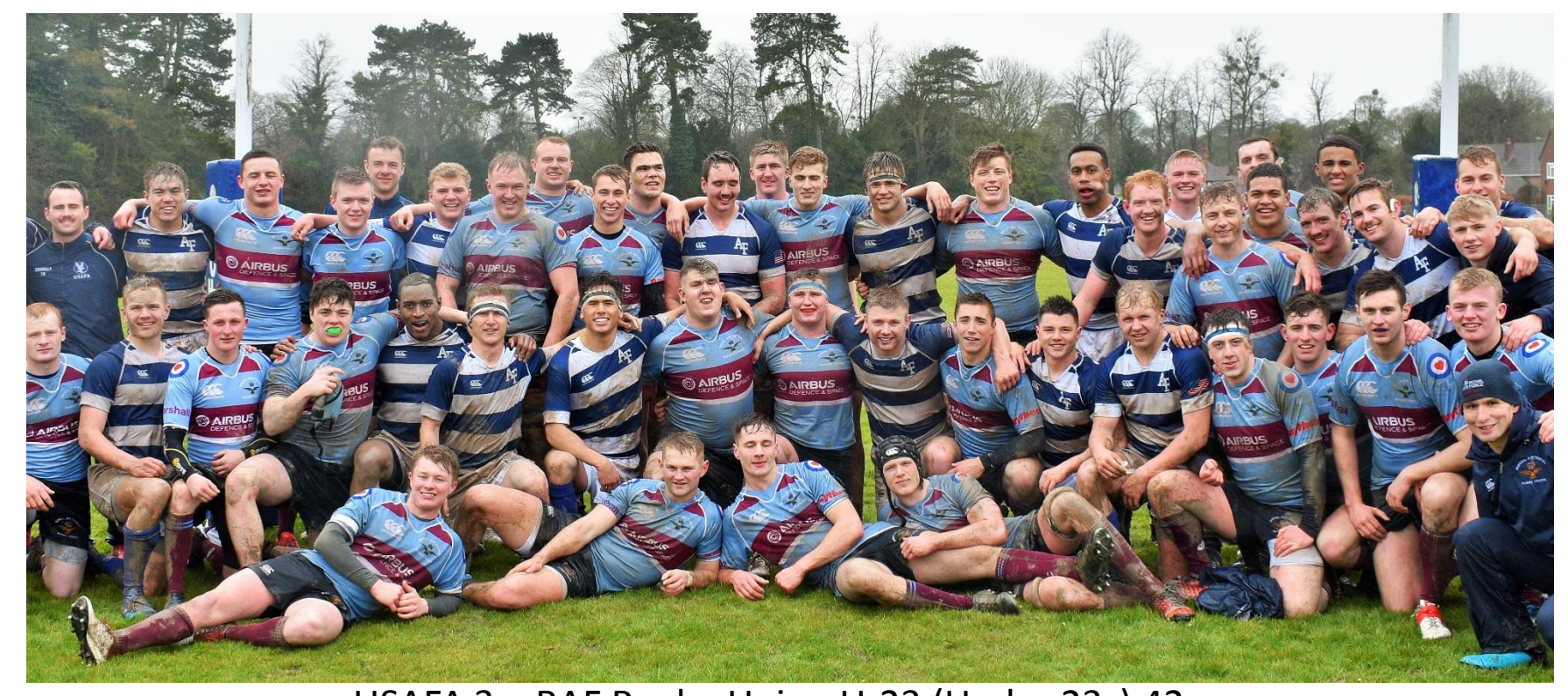
USAFA 3 – RAF Rugby Union U-23 (Under 23s) 42 Played at RAF Station Halton on Thursday, Mar 29