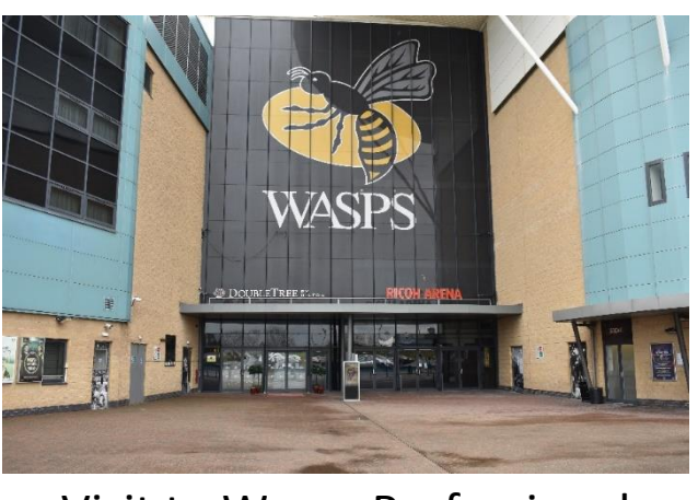
Visit to Wasps Professional Rugby Arena