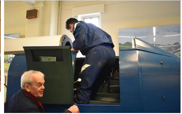
James McCudden Flight Heritage Center's Link Trainers (the briefer pictured did an exchange week at USAFA in 1969)