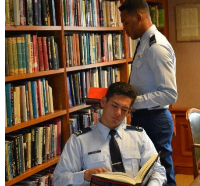
Tour of RAF Library where TE Lawerence penned the 7 Pillars of Wisdom