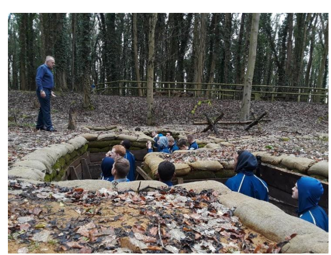
Briefings on trench warfare at RAF Halton